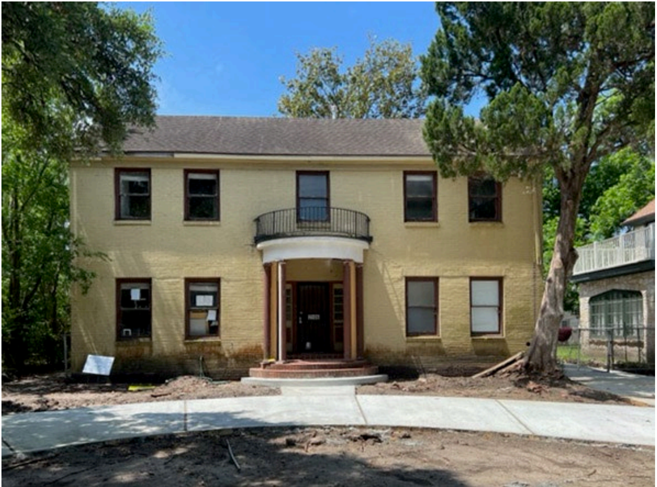
EXHIBIT A CURRENT PHOTOS THE WILBANKS-HANNAH HOUSE 2506 ROSEDALE STREET, HOUSTON, TEXAS 77004