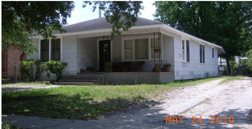
Google Images Dated From April 2022