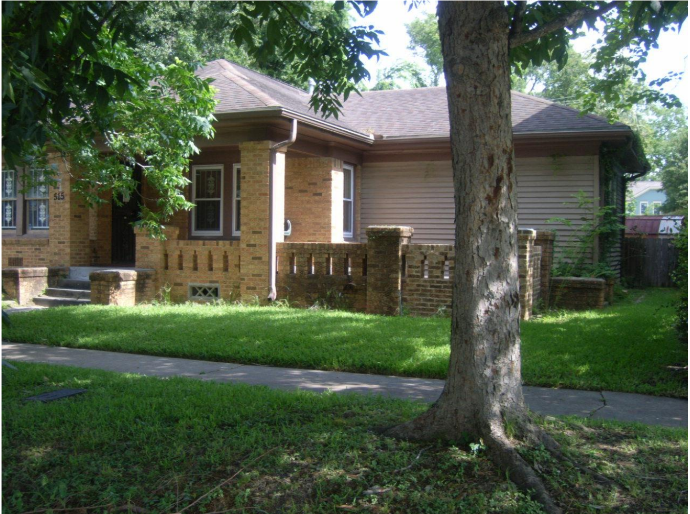
Figure 1 - June 2010