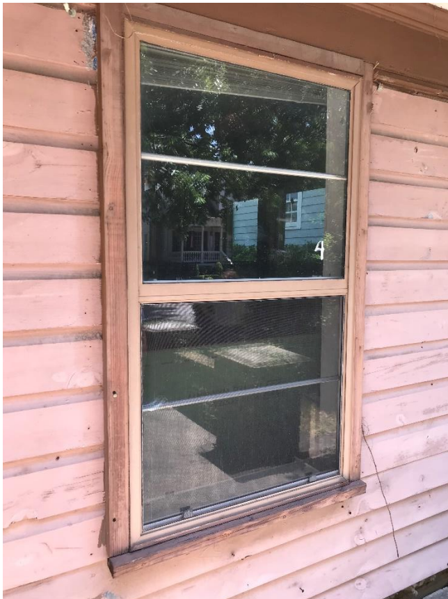
Figure 4 - Alum window in infilled porch