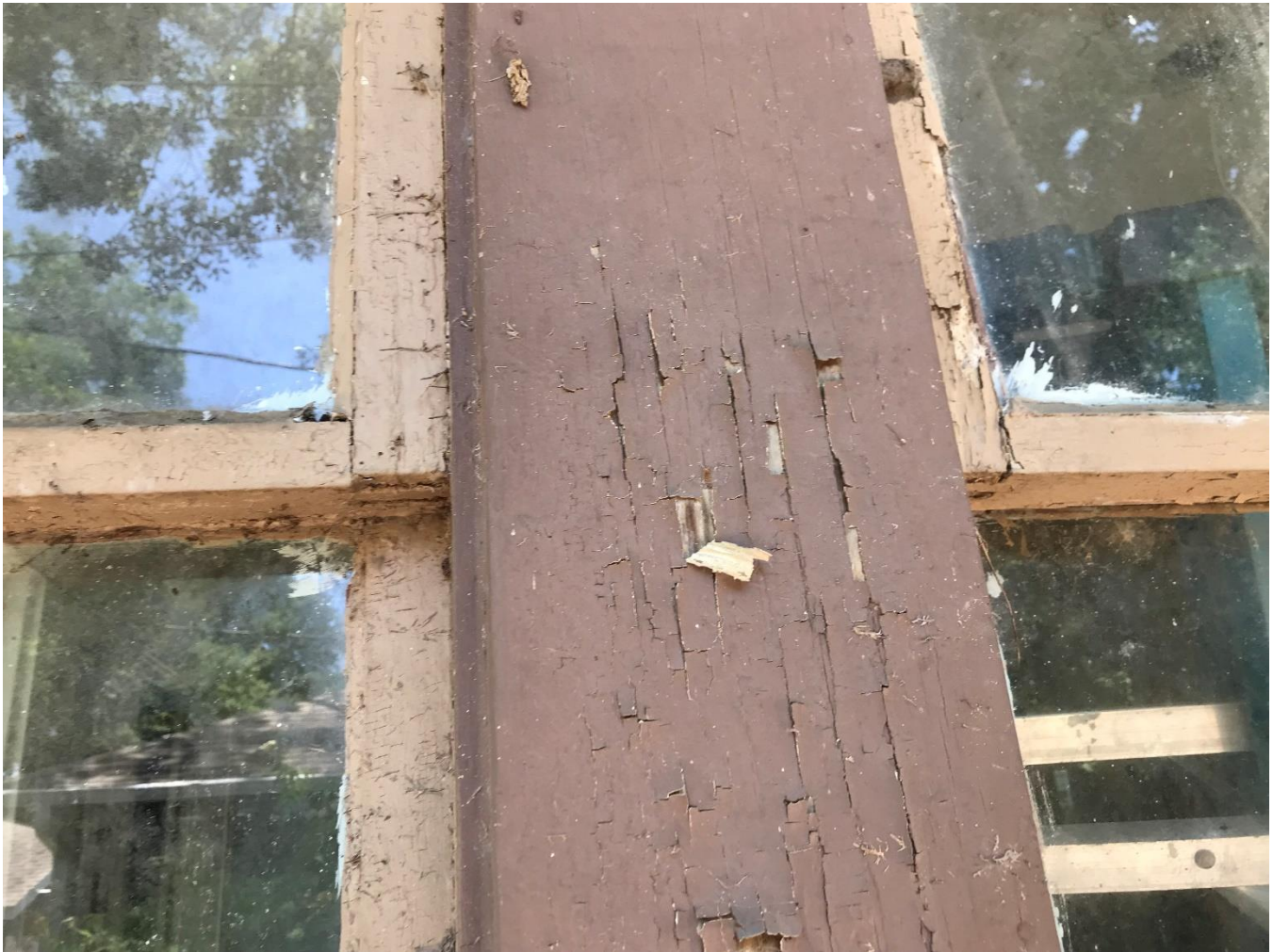
Figure 8 - - Staff photo - June 2022