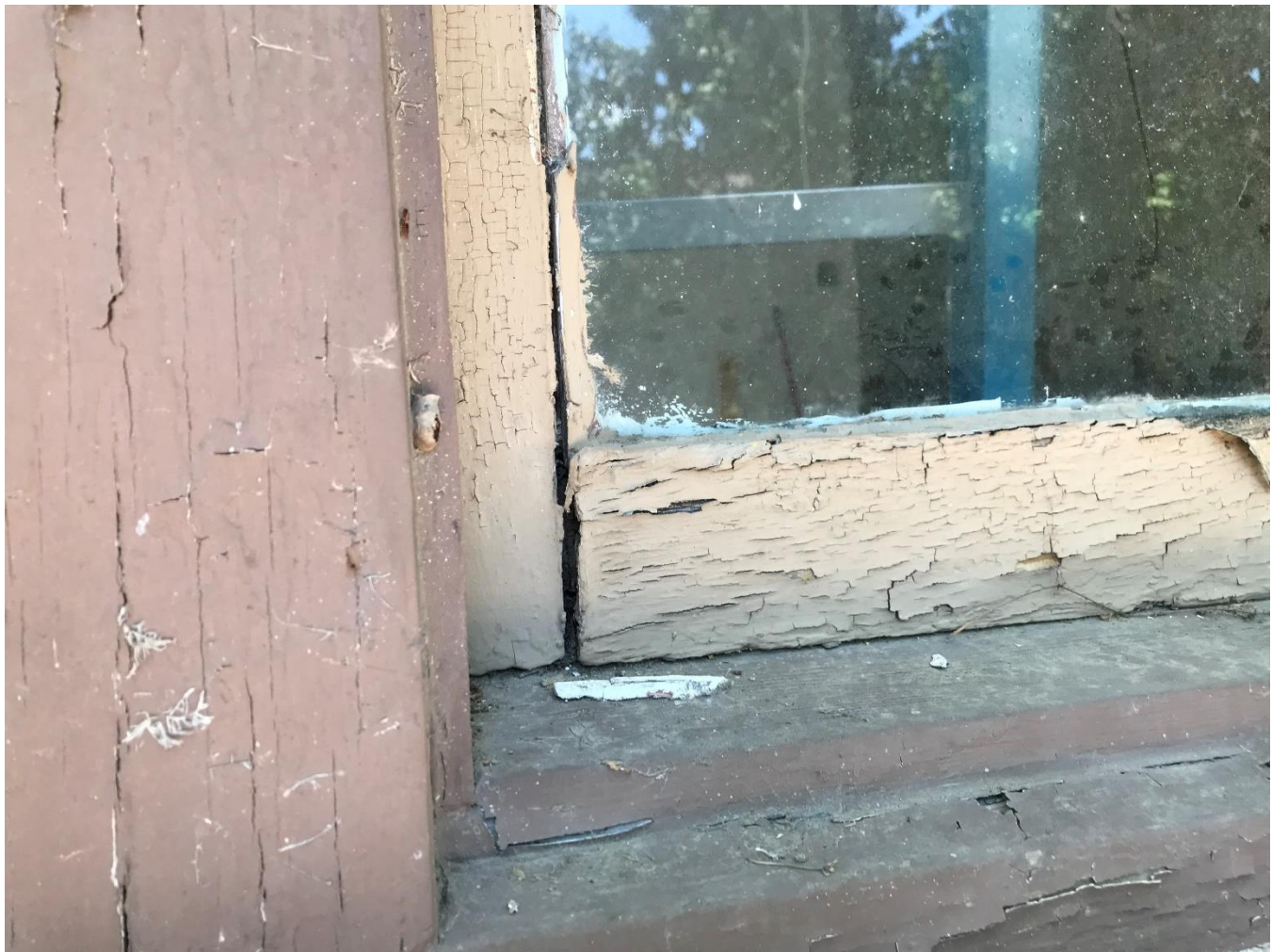
Figure 10 - - Staff photo - June 2022