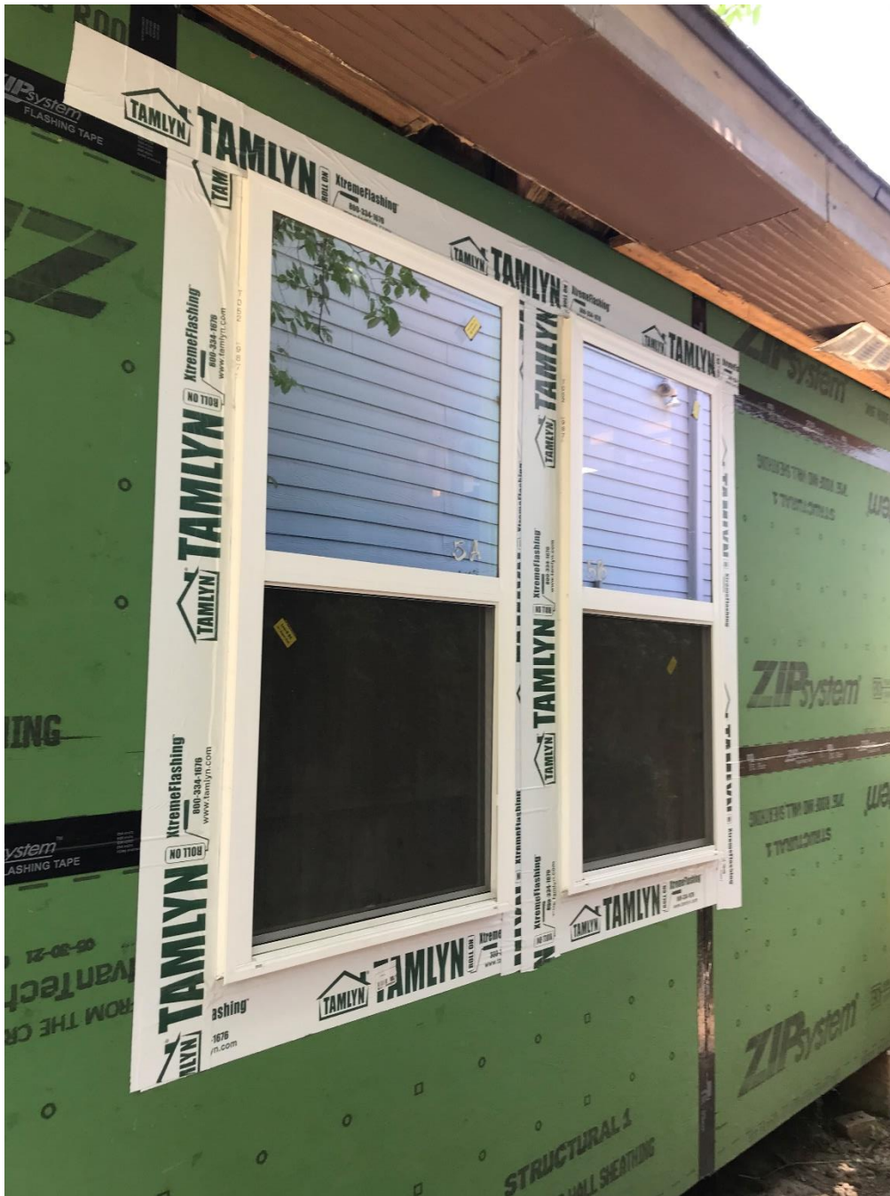
Figure 11 - side of infilled porch - inappropriate windows, installed on surface-would need to become inset and recessed