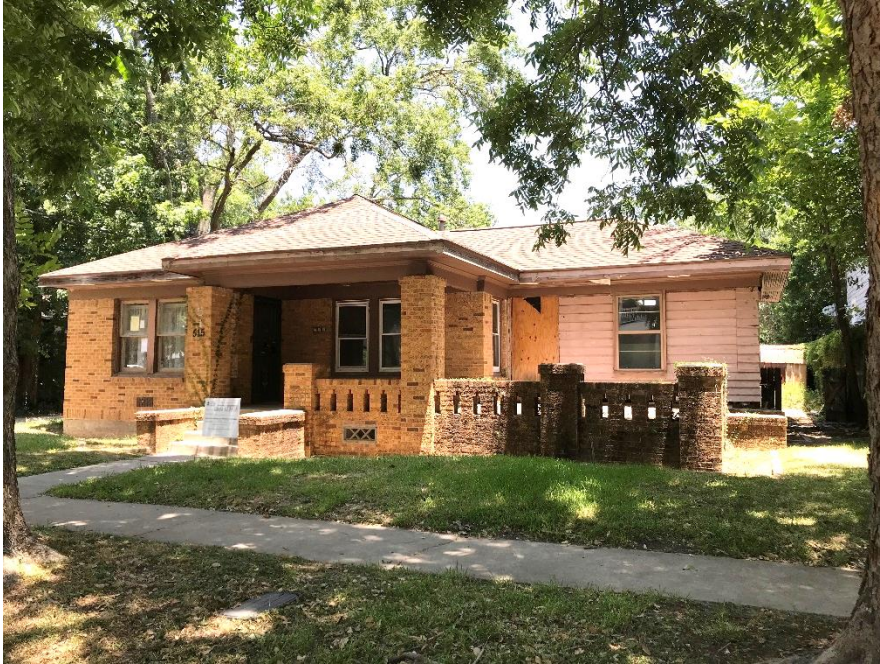
Figure 2 - Staff photo June 2022