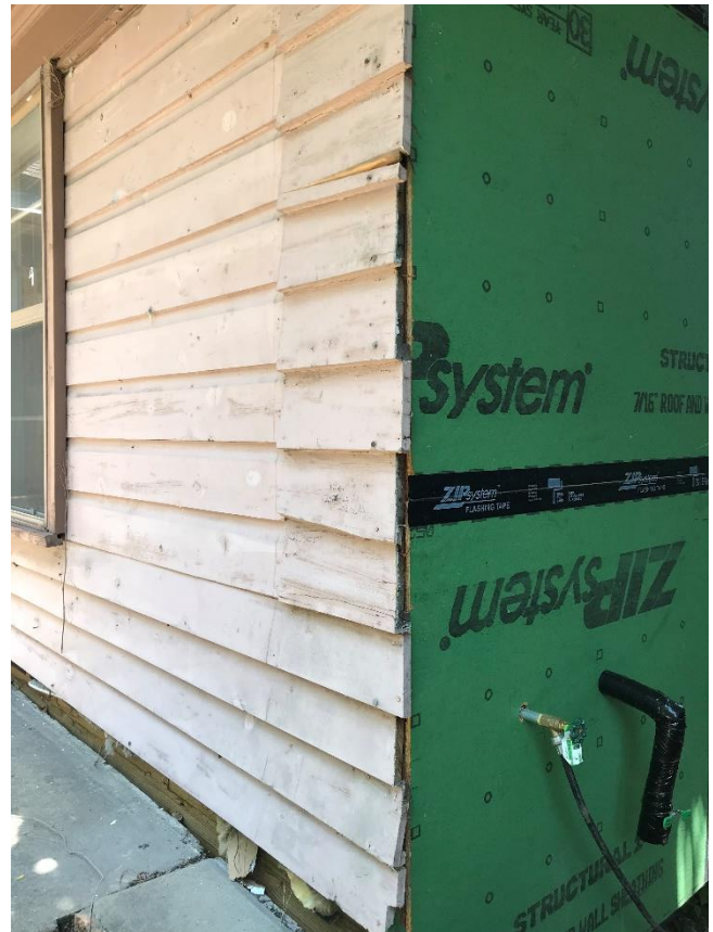
Figure 3 - 2 forms of siding under removed synthetic siding