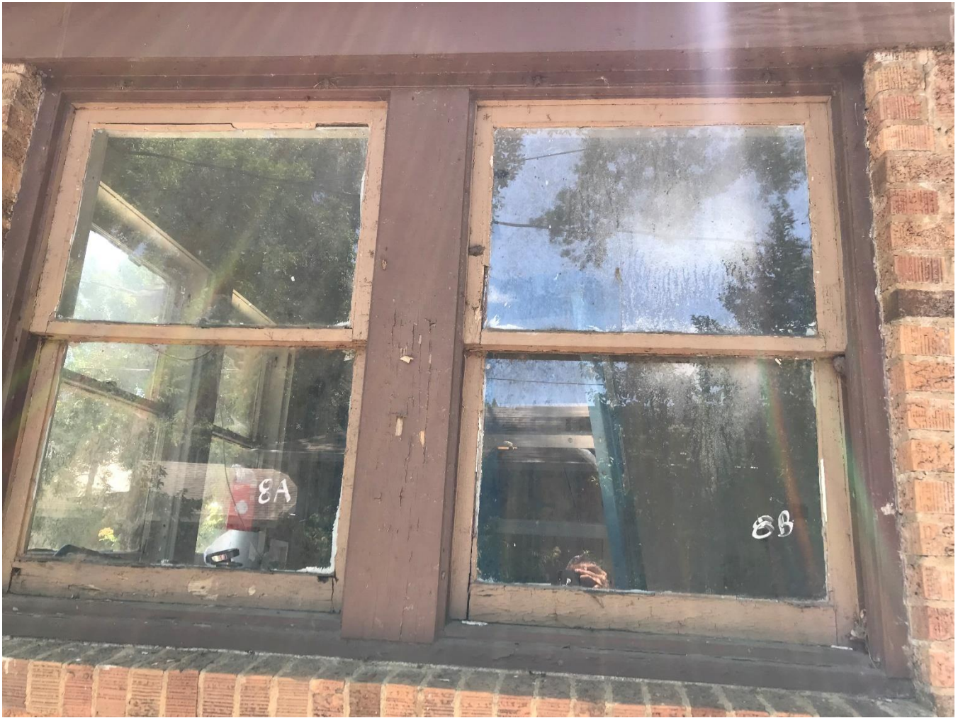
Figure 9 - - Staff photo - June 2022