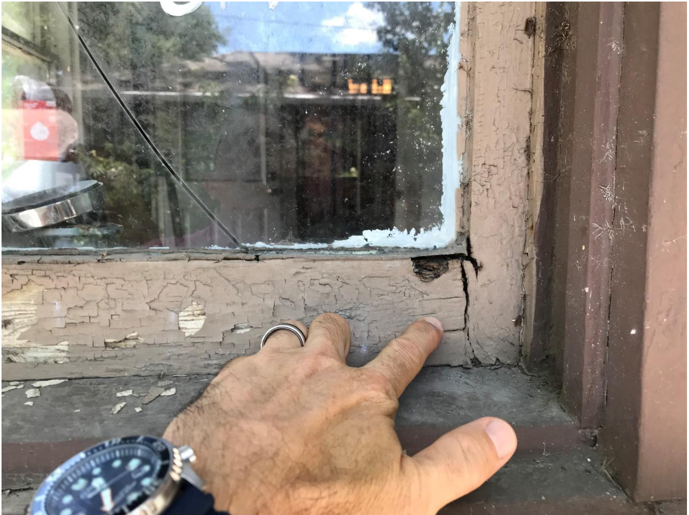
Figure 6 - - Staff photo - June 2022