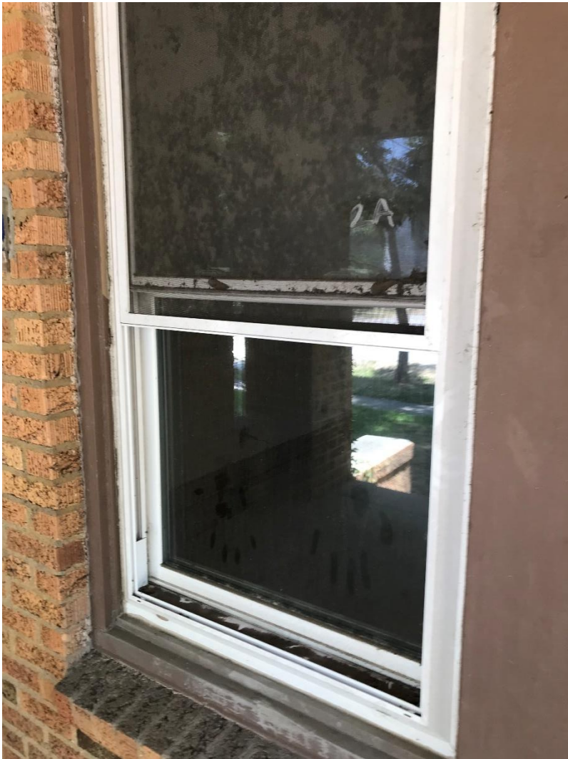
Figure 5 - Staff photo - June 2022