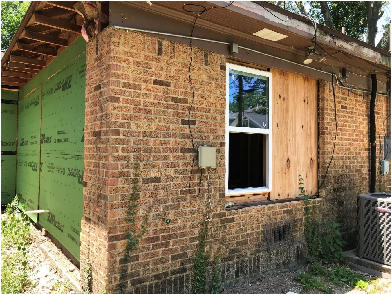
Figure 12 - Rear of house - one window replaced