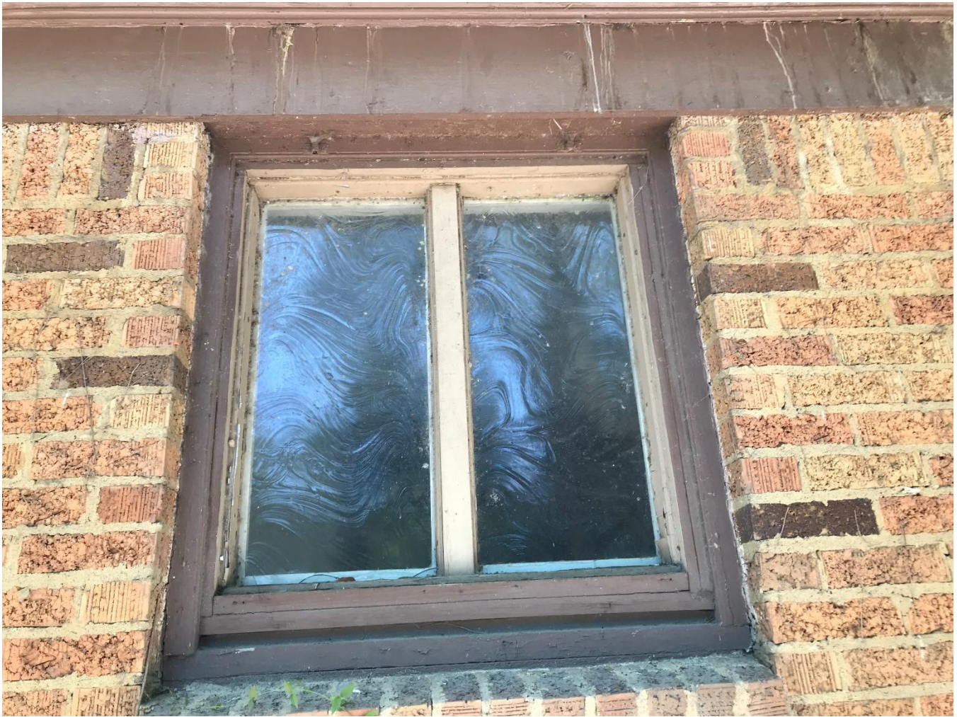
Figure 7 - - Staff photo - June 2022