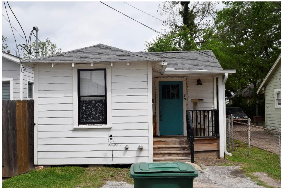
129 E. 31 st 1/2 St. CONTRIBUTING