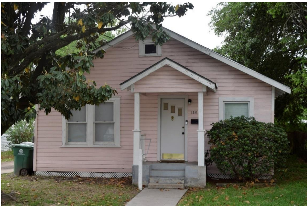
138 E. 31 st ½ St. CONTRIBUTING