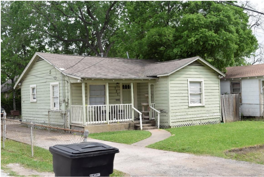
133 E. 31 st ½ St. CONTRIBUTING