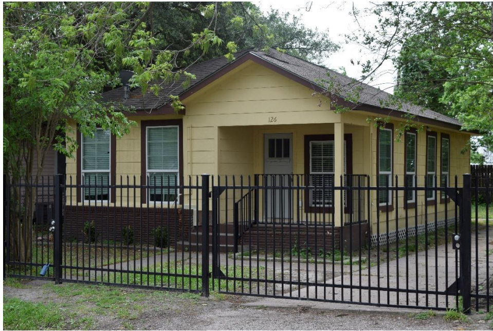
126 E. 31 st 1/2 St. CONTRIBUTING