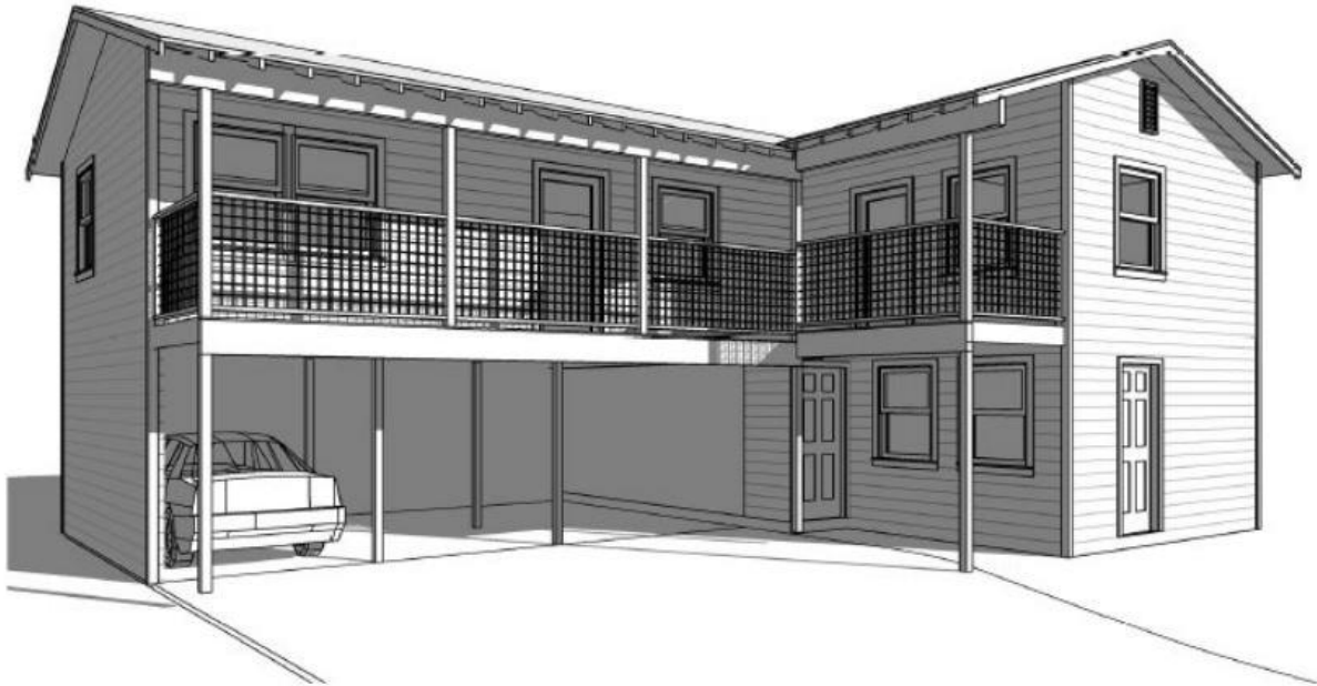
Building faces north.