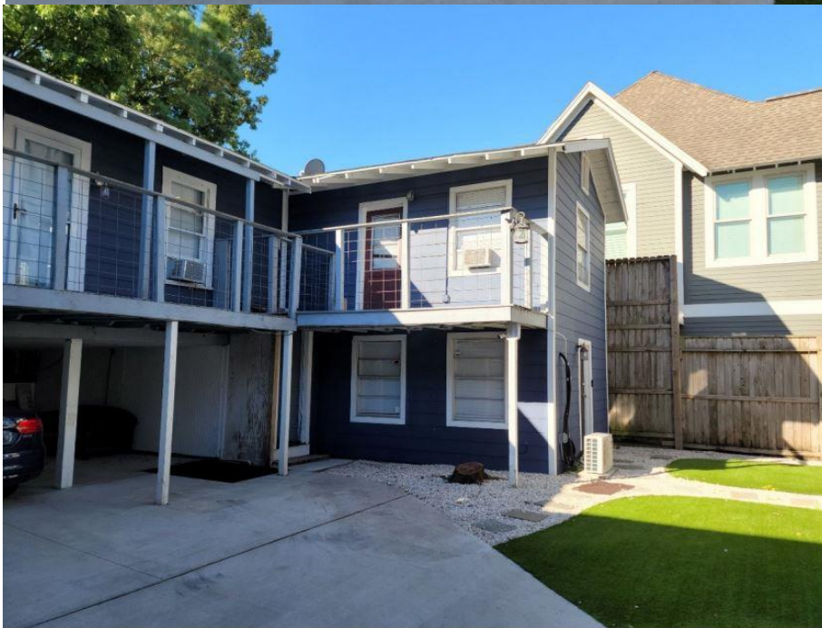
Secondary contributing structure