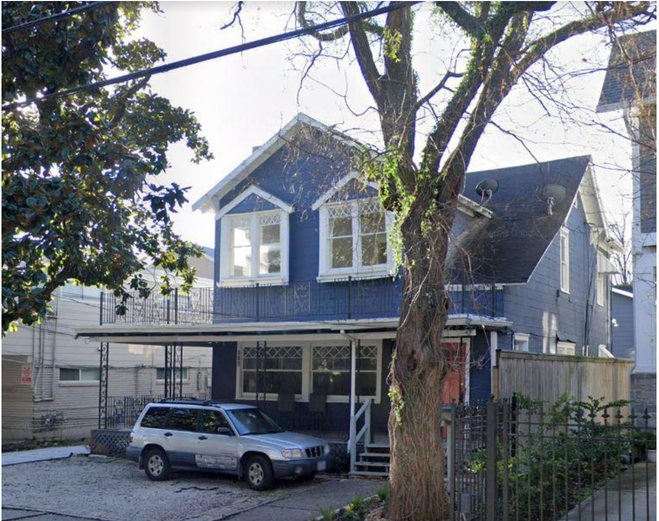
Primary historic structure