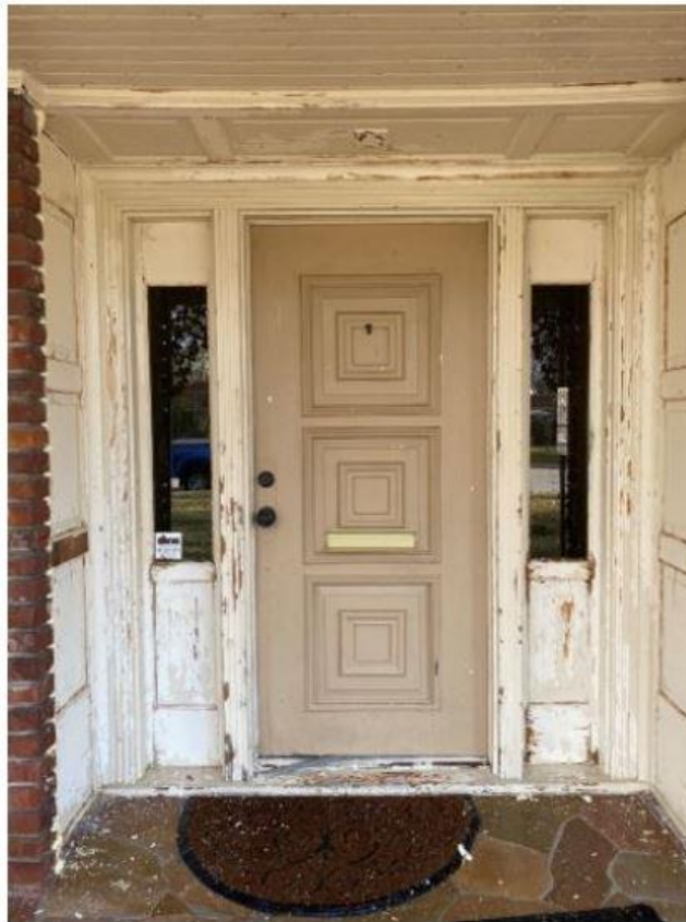
Door Before Replacement