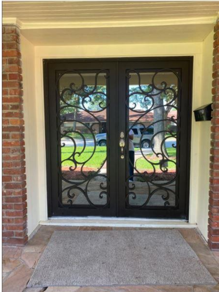
Door After Replacement