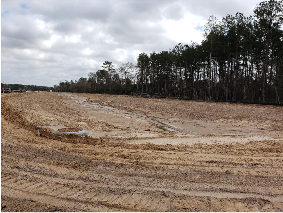
View of Detention Pond #2 Looking East Note: Pond requires stabilization