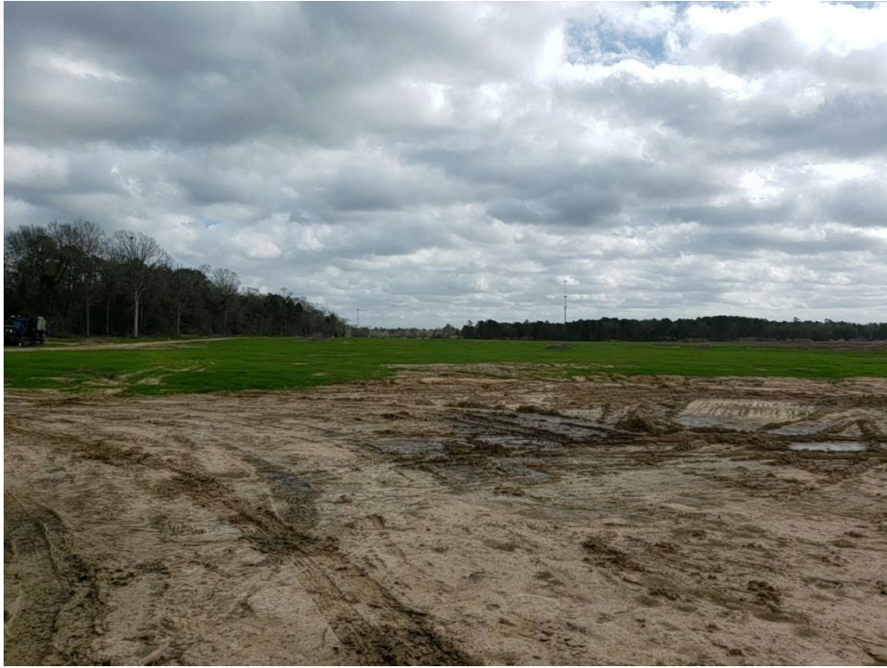
View of Northern Clear-cut Area Looking East Note: All trees and brush have not been chipped