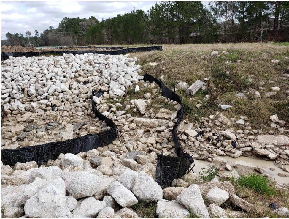
View of Outfall of Detention Pond #1 to Taylor Gulley Note: Silt fences are well maintained