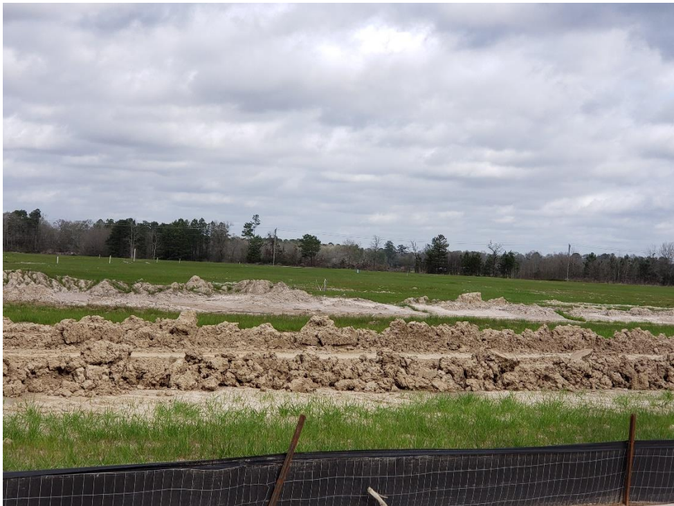
View of South Construction Area with Grass Stabilization