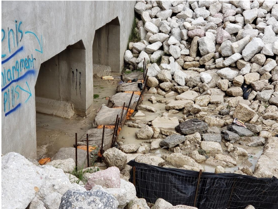
View of Outfall of Detention Pond #1 to Taylor Gulley Note: Hay Bales are well maintained