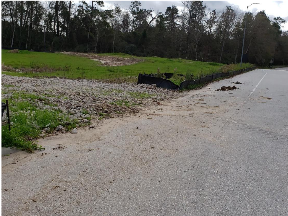
View of Construction Site Entrance on Woodland Hills Drive Note: Moderate to heavy tracking