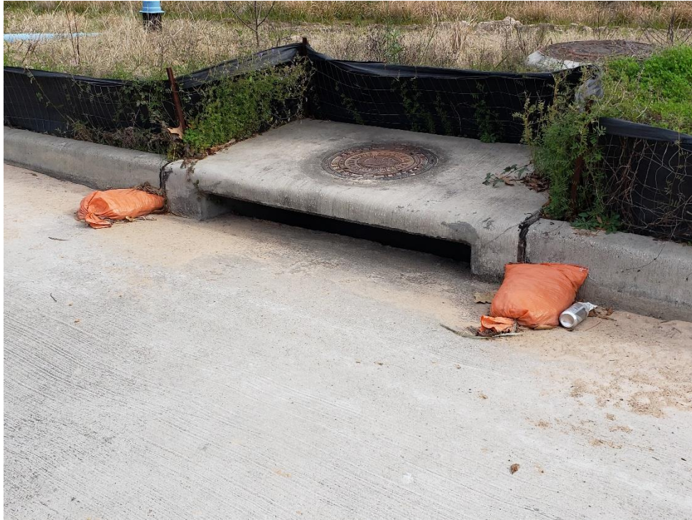
Inlet Protection on Woodland Hills Drive Note: Requires maintenance