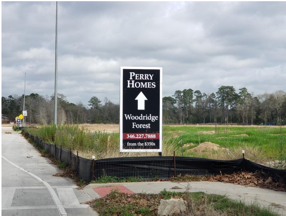
Signage on Woodland Hills Drive