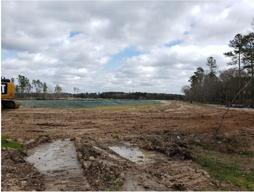
View of Detention Pond #1 Looking Northeast