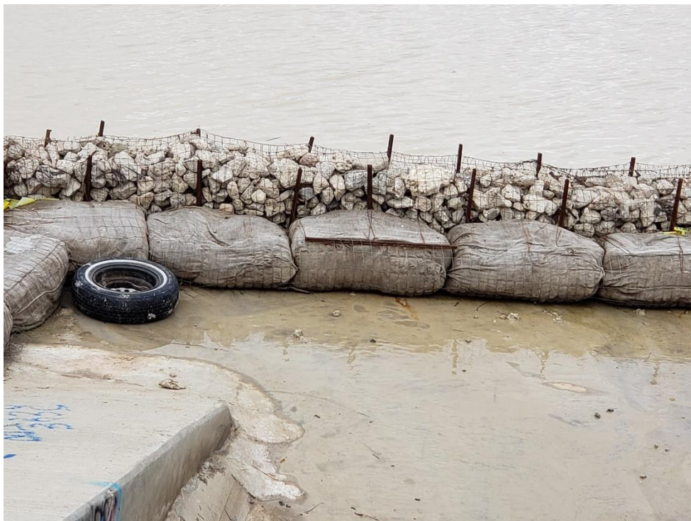
Close View of Hay Bales