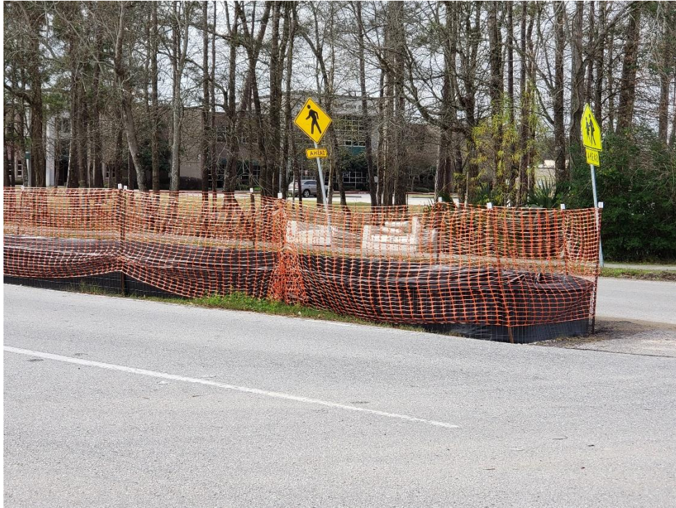
Median Protection on Woodland Hills Drive