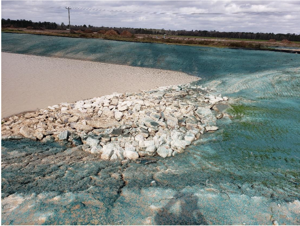
View of Overflow from Montgomery County Flood Control Ditch to Detention Pond #1 Note: This area has been re-stabilized with Hydro-Mulch