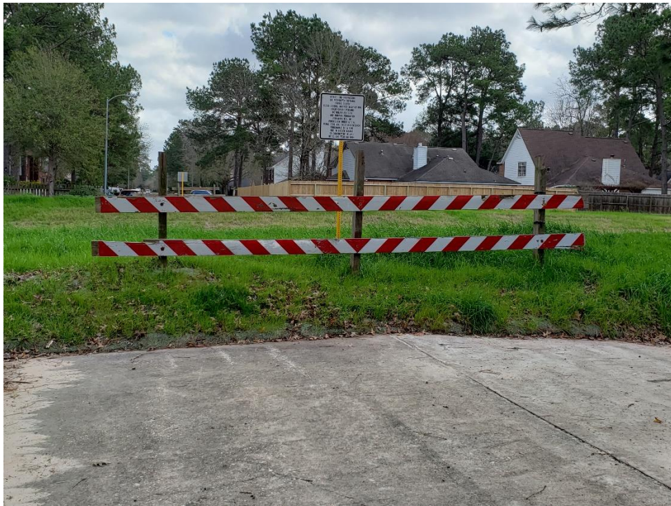
View of Vegetation at Creek Manor Drive