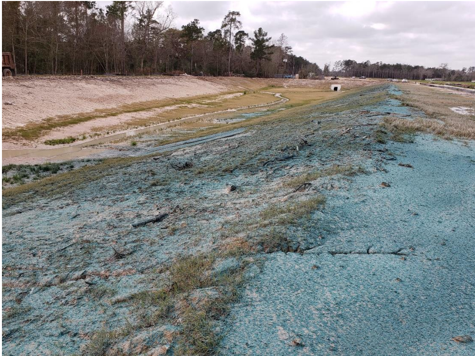
View of Hydro-Mulch Stabilized Ditch between Detention Pond #1 and #2