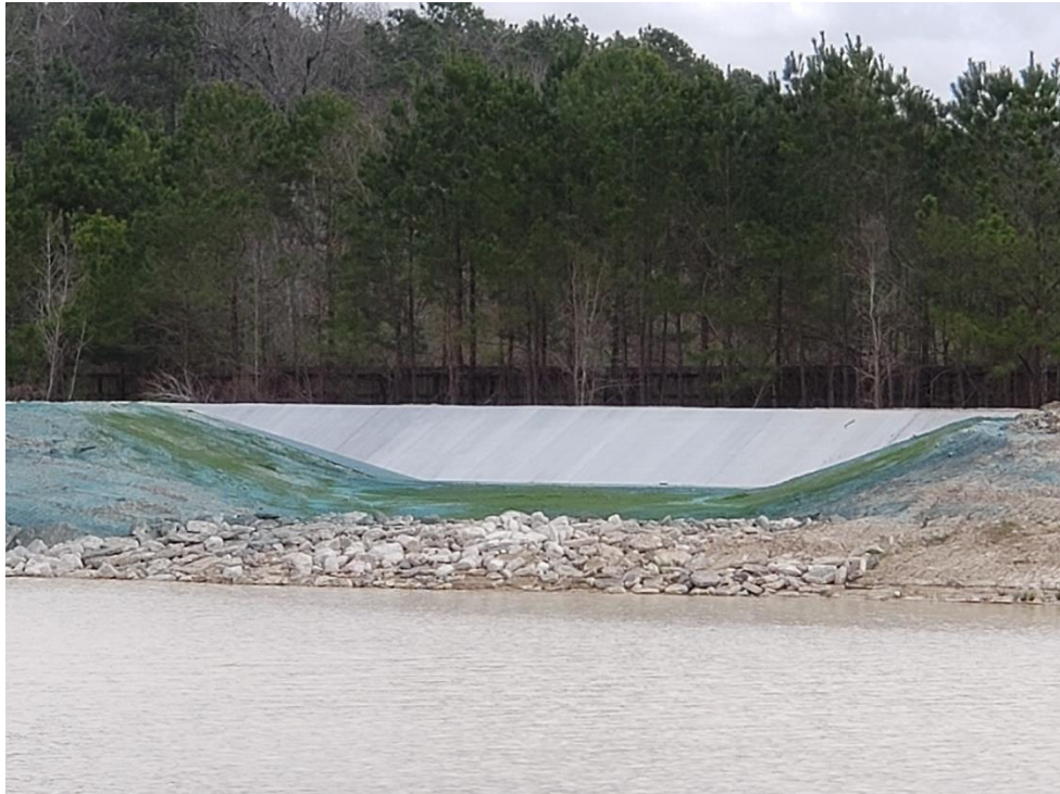
View of Overflow from Montgomery County Flood Control Ditch to Detention Pond #1 Note: This area has been re-stabilized with Hydro-Mulch