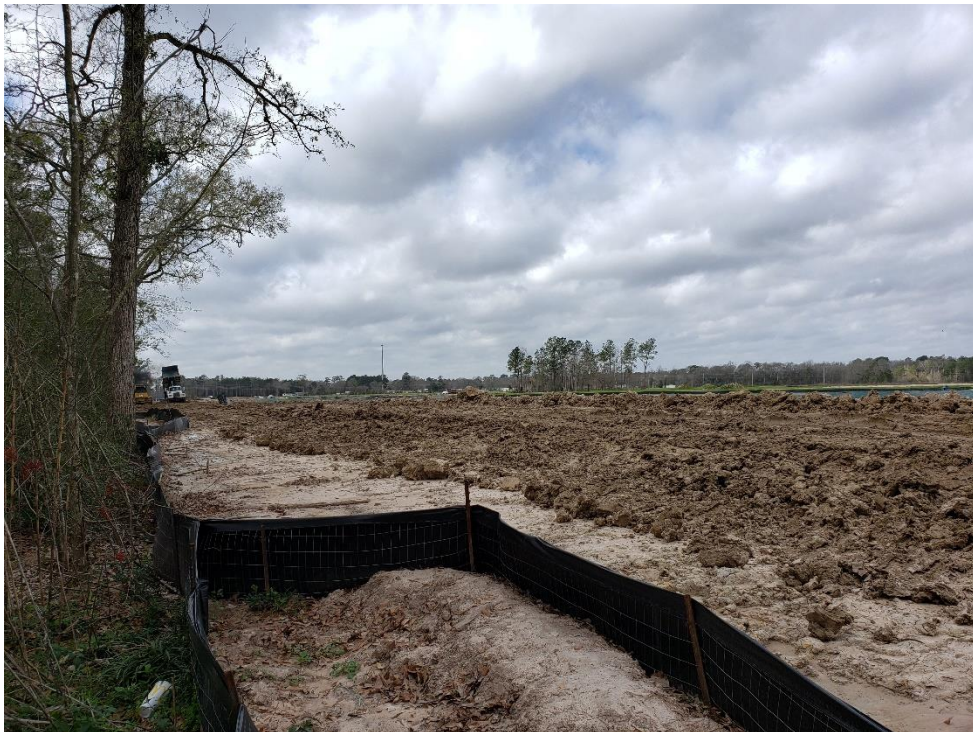
Close View of New Berm Under Construction Between Detention Pond #1 and #2