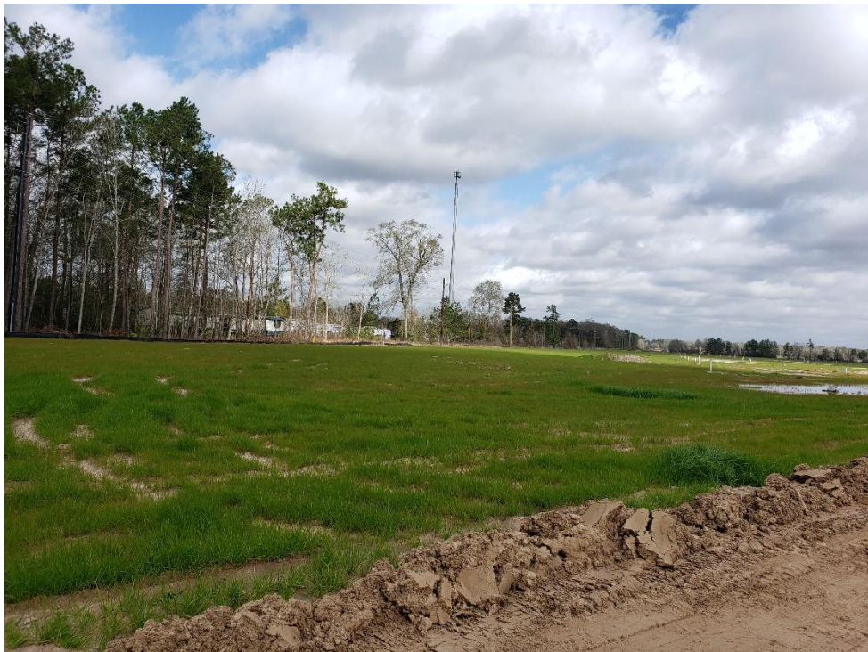
View of South Construction Area with Grass Stabilization