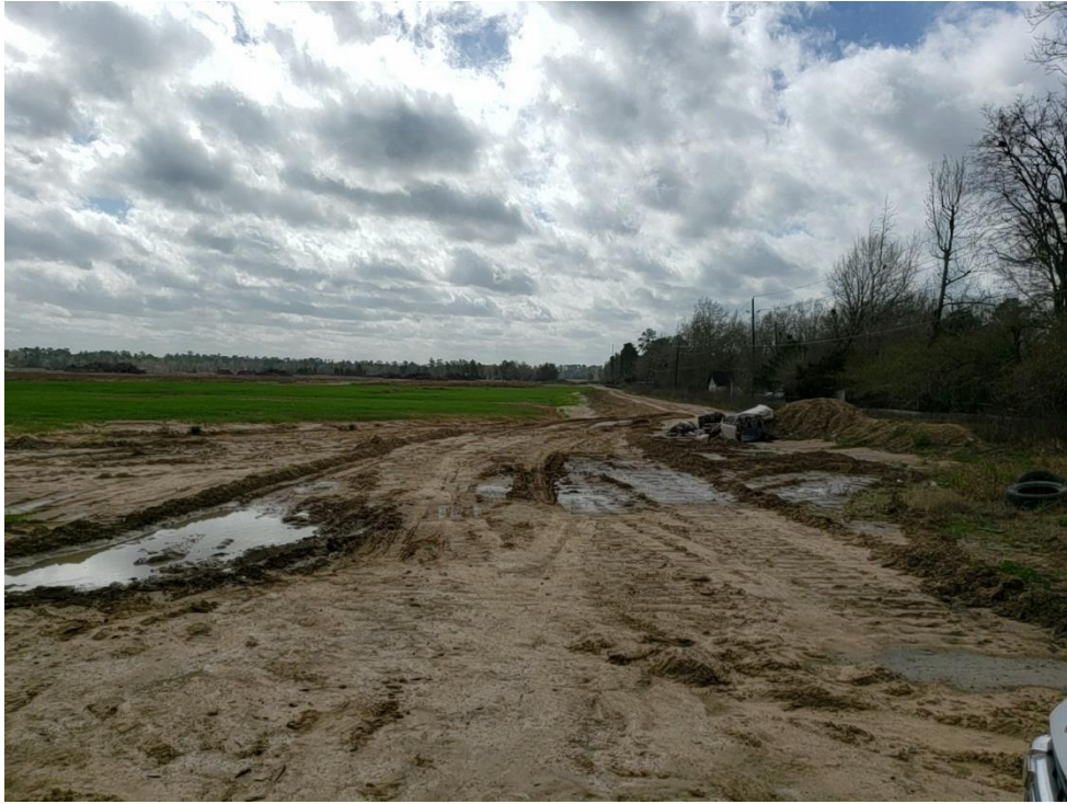
View of Northern Clear-cut Area Looking South Note: Area is partially stabilized