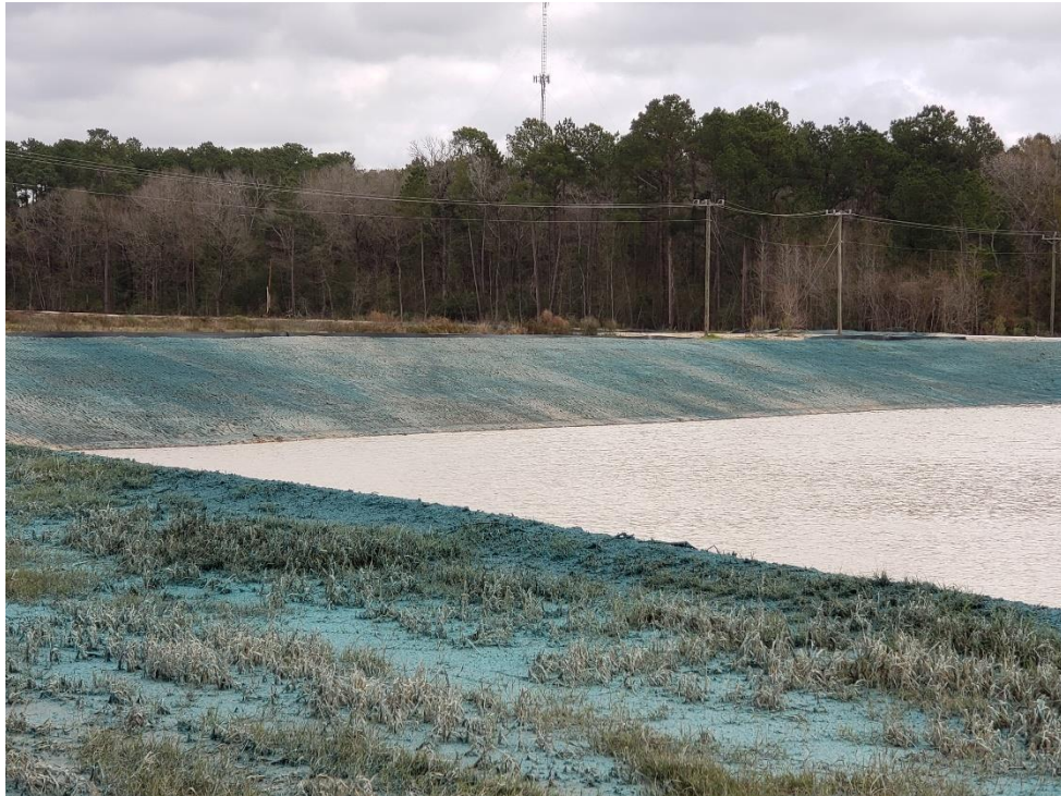
Detention Pond #1 Side Slopes are Dressed and Stabilized with Hydro-Mulch