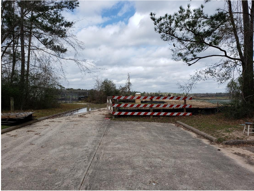
View of Fair Grove Drive