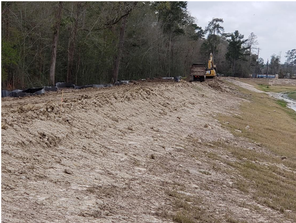
View of New Berm Between Detention Pond #1 and #2 Under Construction