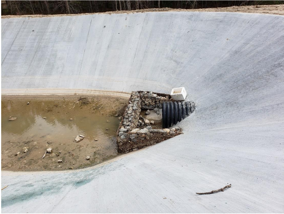
Upstream Outfall of Montgomery County Flood Control Ditch to Taylor Gulley Note: Debris retained by rock gabions