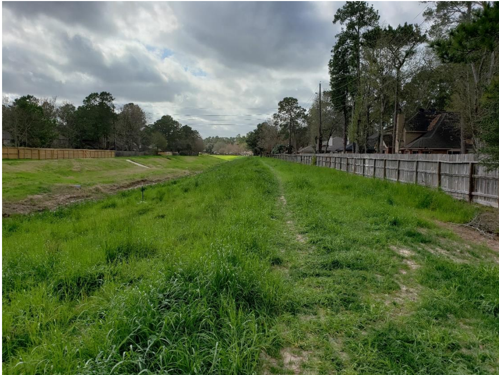
View of Taylor Gulley Looking South Note: Vegetation is well established