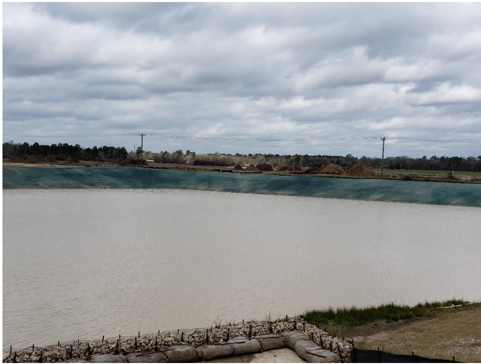
Detention Pond #1 Side Slopes are Dressed and Stabilized with Hydro-Mulch