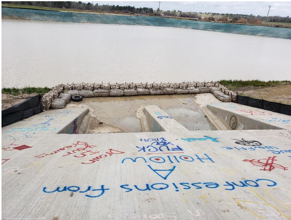
View of Upstream Outfall Structure from Detention Pond #1 to Taylor Gulley Note: Hay bales are in place and well maintained