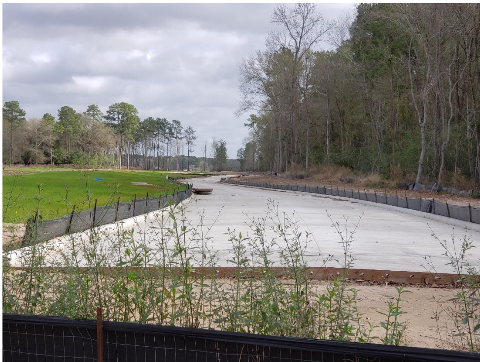
New Street to be Connected to Woodland Hills Drive