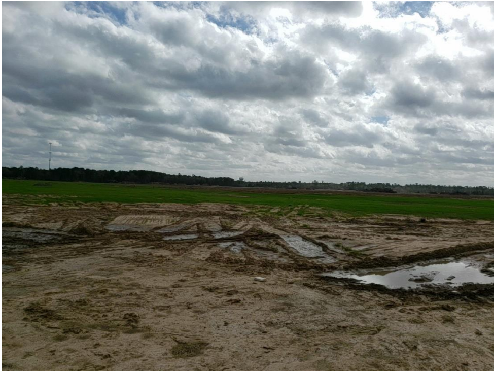
View of Northern Clear-cut Area Looking Southeast Note: All trees and brush have not been chipped