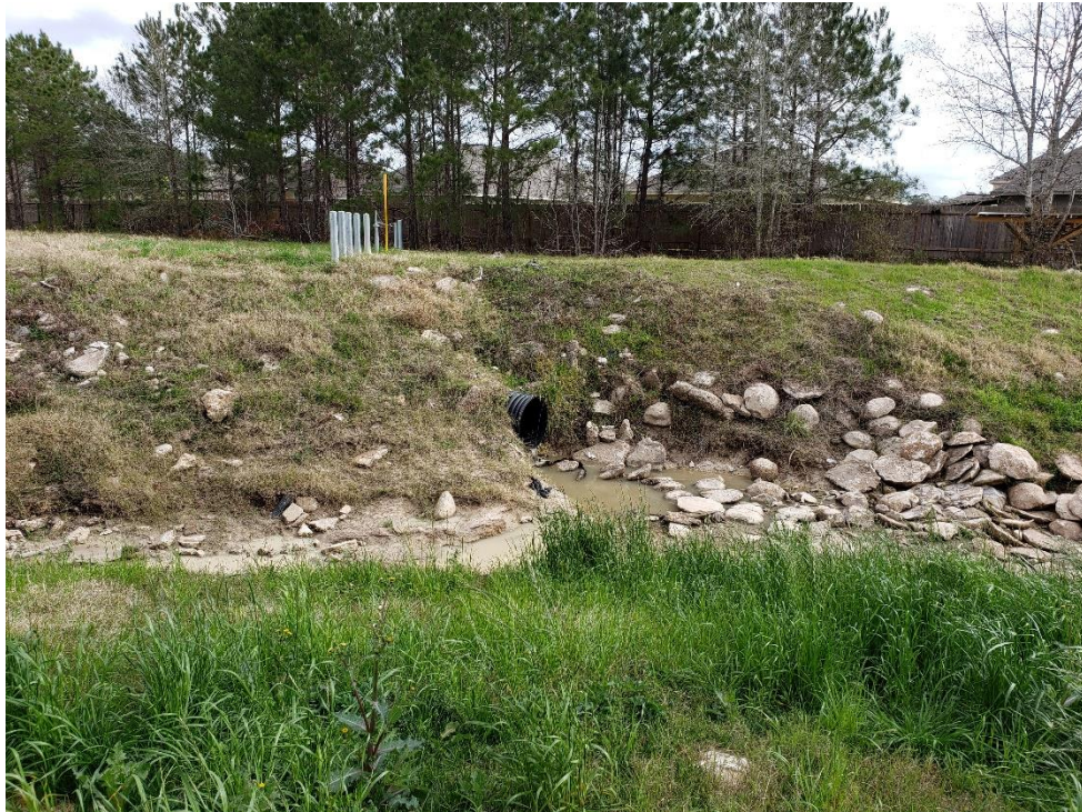
View of Montgomery County Flood Control Ditch Outfall to Taylor Gulley