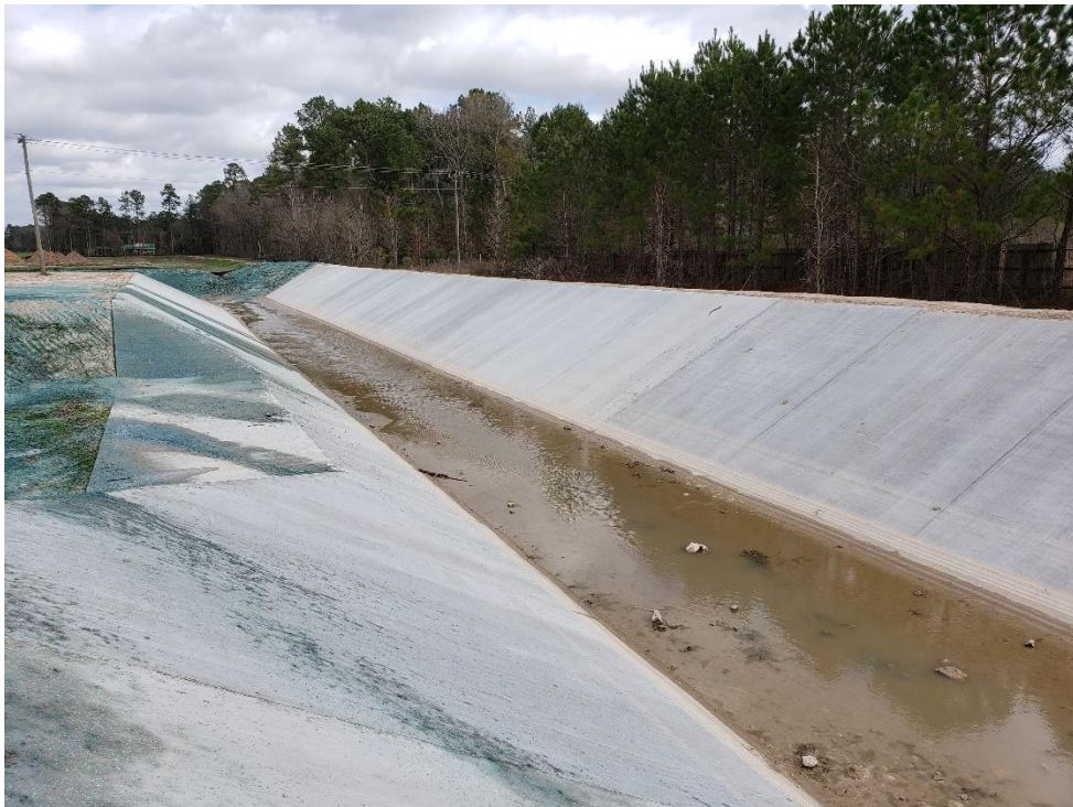
View of Montgomery County Flood Control Ditch with Concrete Slopes