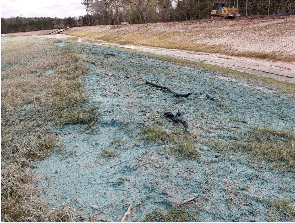
View of Hydro-Mulch Stabilized Ditch between Detention Pond #1 and #2