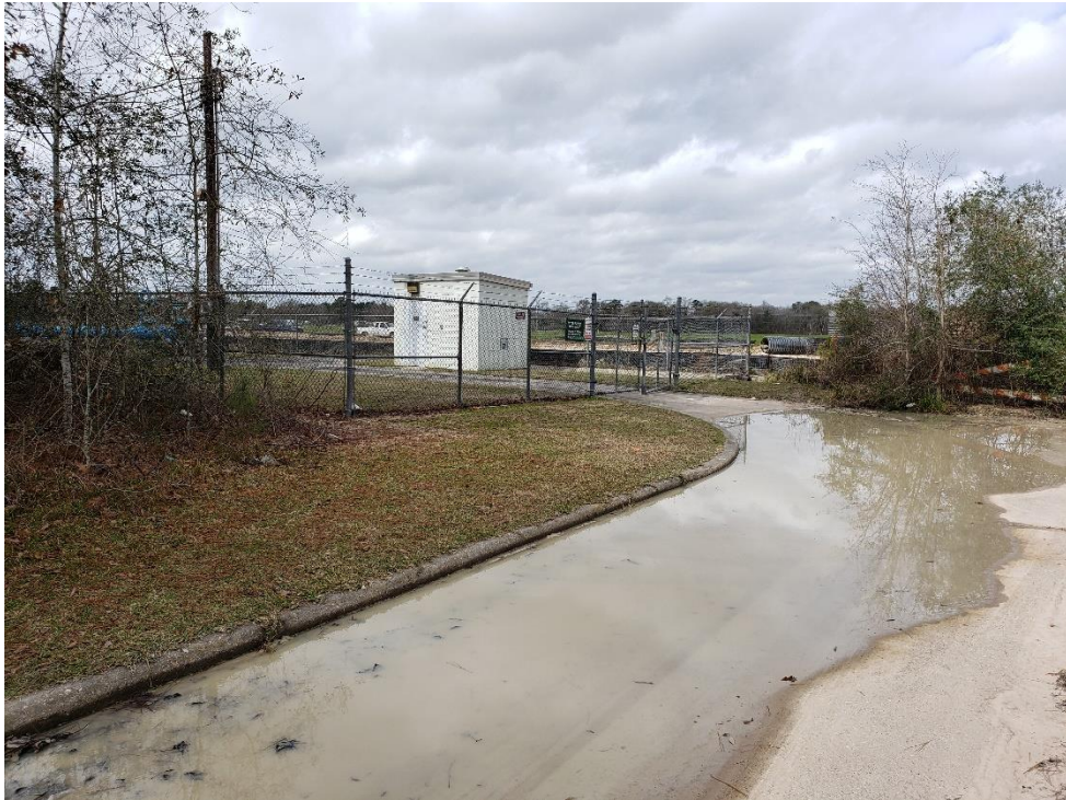
View of Driveway to COH Well #6 Note: Ponding from recent rain