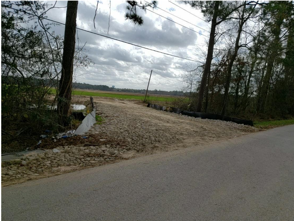
View of Construction Entrance on Webb Road Note: Light to moderate tracking