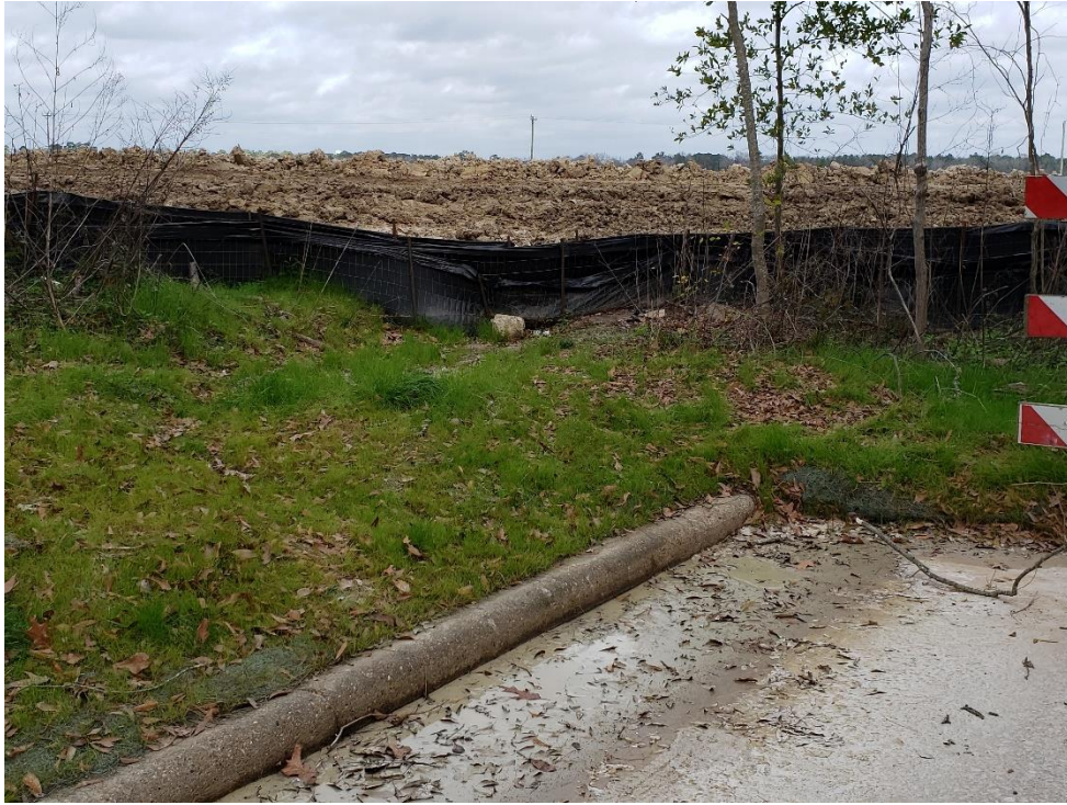
Vegetation at End of Village Springs Drive Note: Berm under construction in background