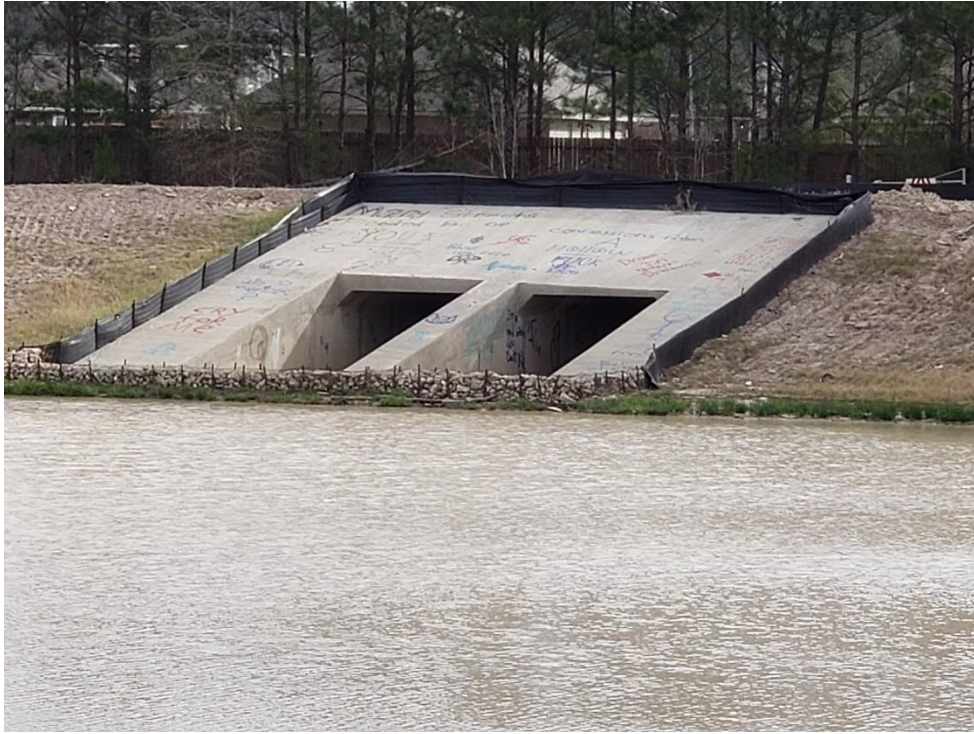
View of Upstream Outfall Structure from Detention Pond #1 to Taylor Gulley