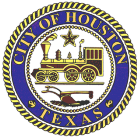
EXHIBIT – “A”